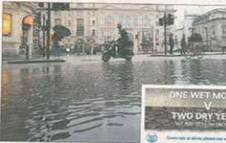
Metlands centre: Roads in Piccadilly today, and the adverts being placed on the Tube system