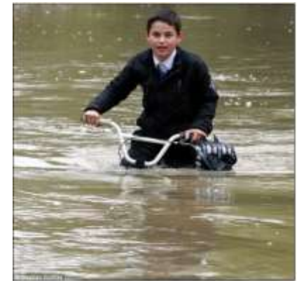
A primary school boy crosses a flooded footpath in Wilton, near Chislehurst, Essex today

Our challenge was to make customers understand