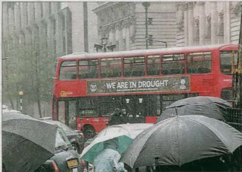
Grey day: Londoners get the wrong message on this bus near Westminster Abbey yesterday