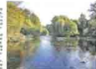
Previous reservoir the Kennet feeds part of Berkshire

The drought is the result of the capital's water supply being cut off. The drought is the result of the capital's water supply being cut off.